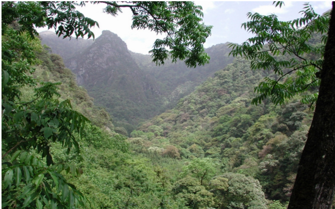
Wuliang Shan (CN251) has a distinct vertical zonation of habitats and the subtropical forests there support rare bird species such as Green Peafowl Pavo muticus , and also Black-crested Gibbon Hylobates concolor .

Key: ● = Protected; ● = Partially protected; ○ = Unprotected.