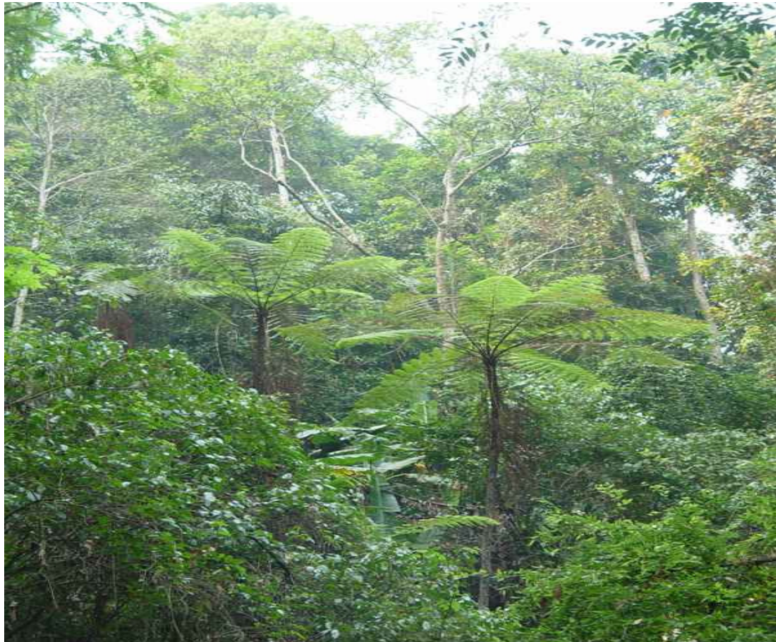
Xishuangbanna (CN261) is a famous tropical forest area in Yunnan, which supports similar biodiversity to that of South-East Asia.

IMPORTANCE TO OTHER FAUNA AND FLORA: Nationally protected plants include Parashorea chinensis , Cycas siamensis and Alsophila spinulosa . Animals include Panthera tigris corbetti , Panthera pardus , Neofelis nebulosa , Hylobates leucogenys , Presbytis phayrei , Nycticebus coucang , Bos gaurus and Elephas maximus .